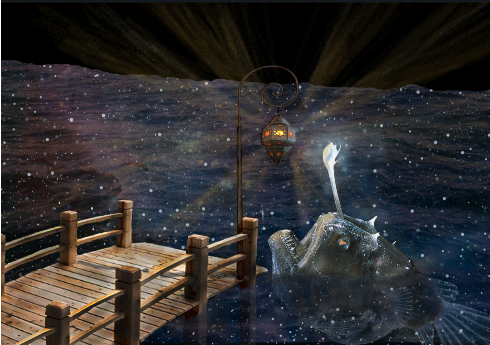
ANGLER FISH FALLS IN LOVE WITH A LANTERN Image composite. Made with Photoshop.