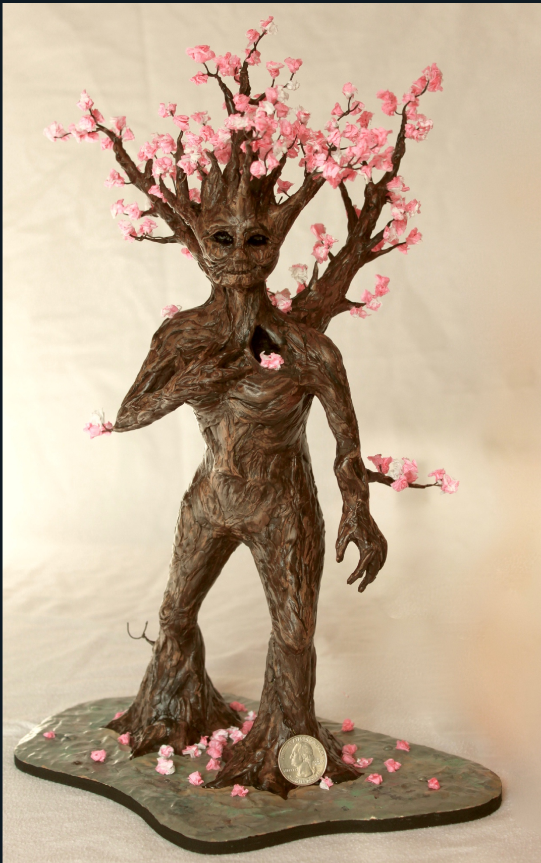
SOBO 14" tall. Japanese Cherry Blossom. Character concept sculpture. Wood, clay, paint, wire, and tissue paper.